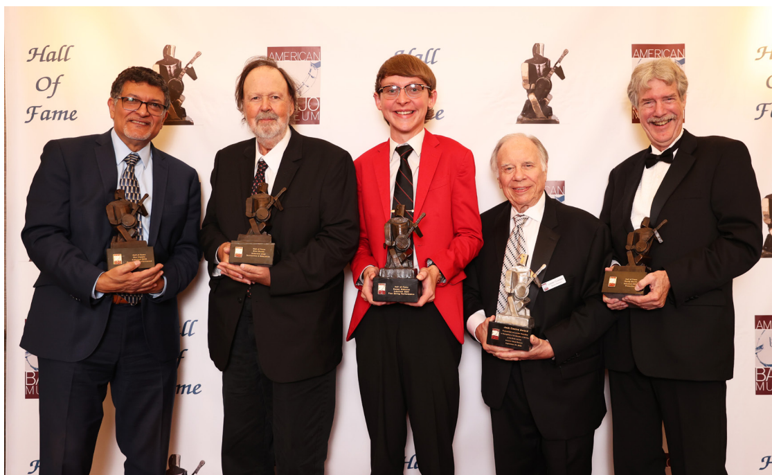
2022 Hall of Fame Inductees From Left to Right: